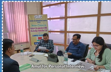
Amul for Personal Interview