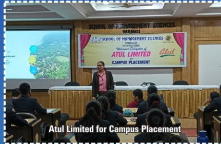
Atul Limited for Campus Placement