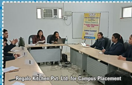
Regalo Kitchen Pvt. Ltd. for Campus Placement