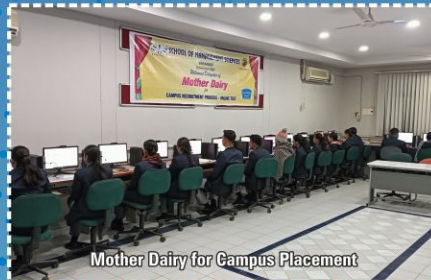
Mother Dairy for Campus Placement