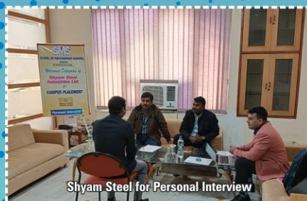
Shyam Steel for Personal Interview