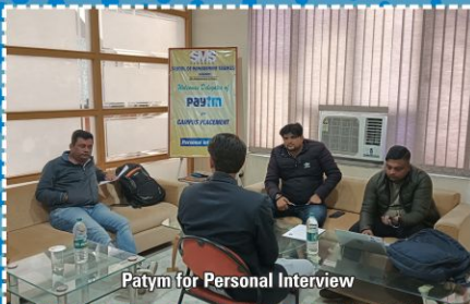
Patym for Personal Interview