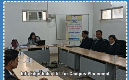
Info Edge India Ltd. for Campus Placement