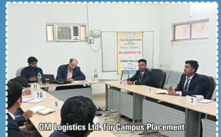
OM Logistics Ltd. for Campus Placement