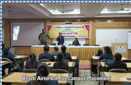
Bharti Airtel Ltd. for Campus Placement