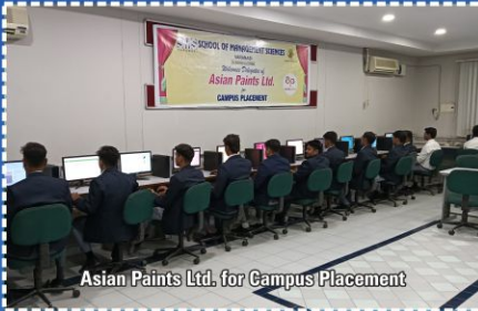
Asian Paints Ltd. for Campus Placement