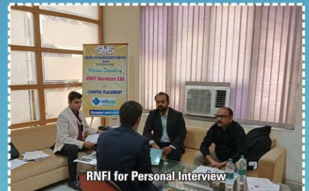
RNFI for Personal Interview