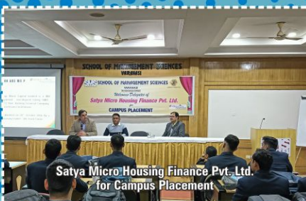
Satya Micro Housing Finance Pvt. Ltd. for Campus Placement