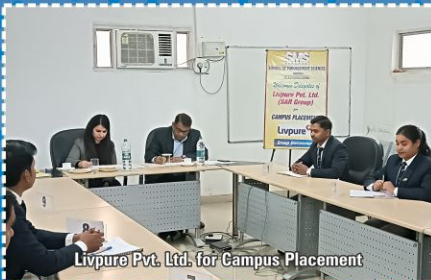
Livpure Pvt. Ltd. for Campus Placement