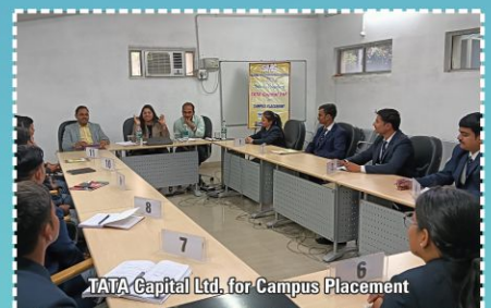
TATA Capital Ltd. for Campus Placement