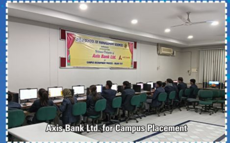
Axis Bank Ltd. for Campus Placement