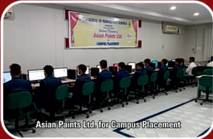
Asian Paints Ltd. for Campus Placement