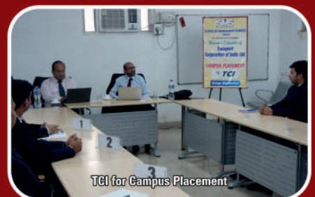
TCL for Campus Placement