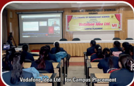
Vodafone Idea Ltd. for Campus Placement