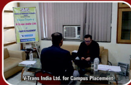
V-Trans India Ltd. for Campus Placement