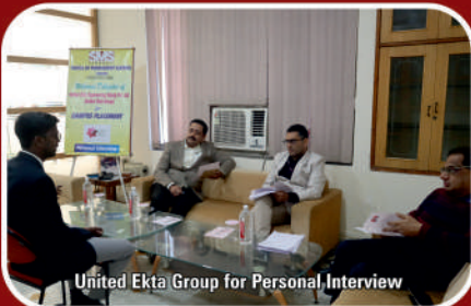
United Ekta Group for Personal Interview