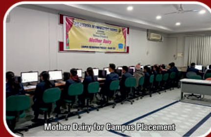
Mother Dairy for Campus Placement