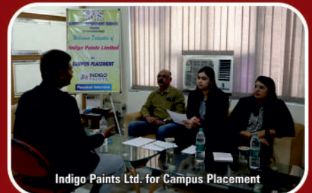
Indigo Paints Ltd. for Campus Placement