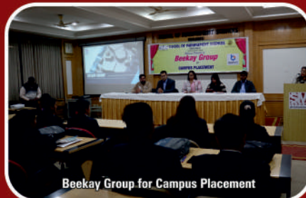
Beekay Group for Campus Placement