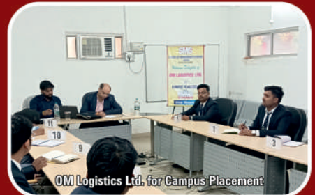
OM Logistics Ltd. for Campus Placement