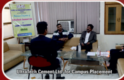
UltraTech Cement Ltd. for Campus Placement