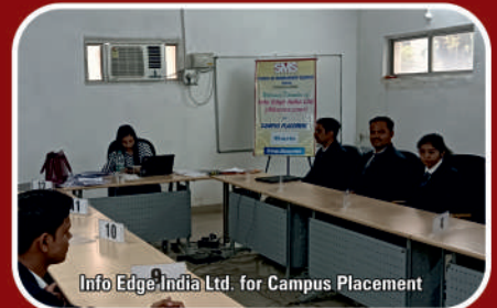
Info Edge India Ltd. for Campus Placement