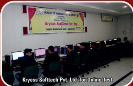
Kryoss Softtech Pvt. Ltd. for Online Test