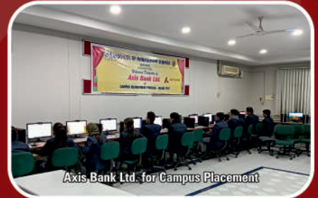
Axis Bank Ltd. for Campus Placement