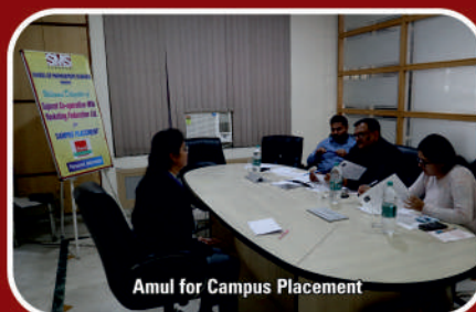
Amul for Campus Placement