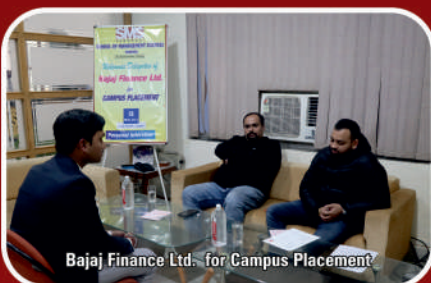
Bajaj Finance Ltd. for Campus Placement