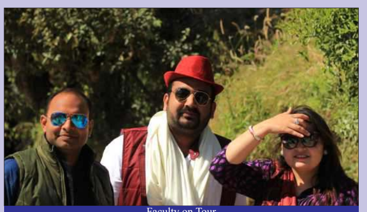
Faculty on Tour