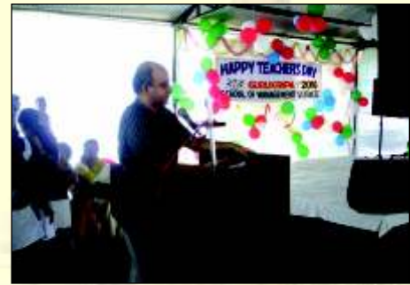
Prof. P.N. Jha, Director, addressing the audience

organized various cultural programmes dedicated to the teachers. Students presented the great Indian culture through heart touching dance performance on the different colors of Indian festivals. The milieu was full of vibrant colors of joy. Teachers were taken back to their college days and were not behind in showcasing their respective talent. The unmatched show put up the students of SMS and the benign presence and blessings of teachers made the day memorable and everlasting. In the end the students felicitated all the teachers of institute.