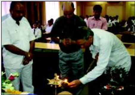
Dignitaries lightning the lamp