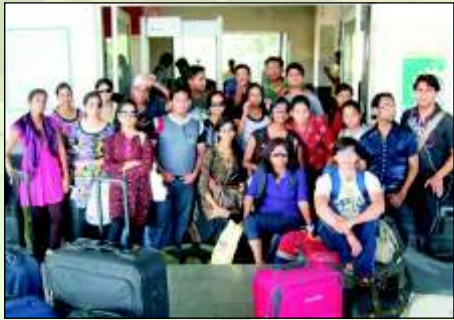
Enjoying Journey time

Third day was the day full of excitement and joy as the students were in Jim Corbett national park. Students went on safari and in the evening enjoyed the bone-fire.