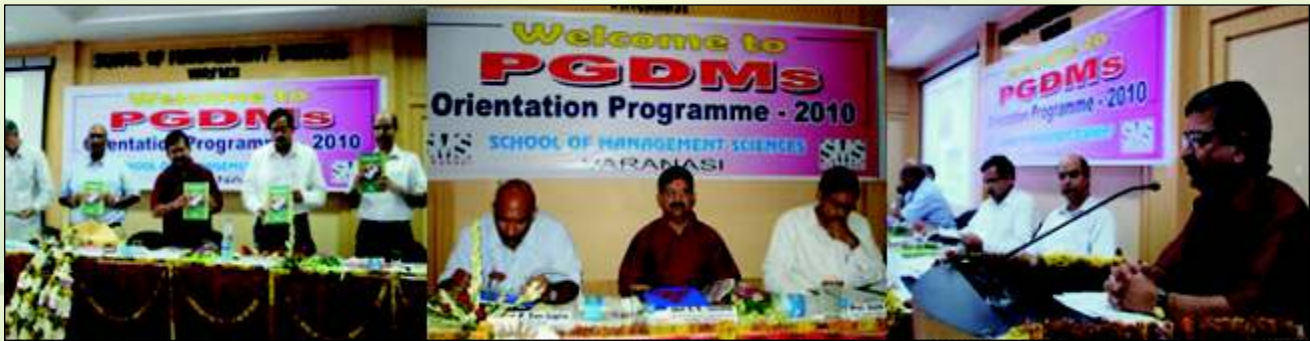
Snapshots of PGDM Orientation Programme