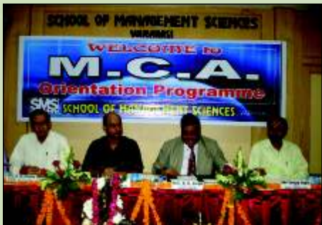
MCA orientation programme scene