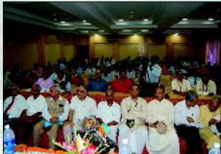
A scene of Conference