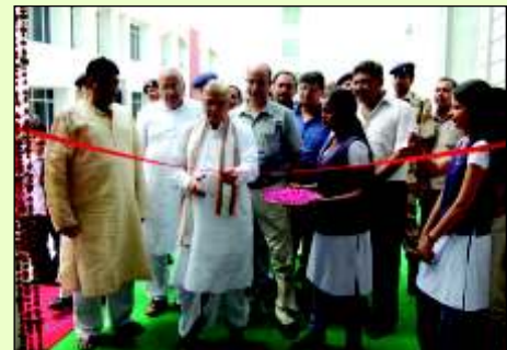
Dr. Joshi Inaugurating New Block

On the auspicious occasion of Independence Day the newly constructed fully A.C. academic block was inaugurated by Dr. Murli Manohar Joshi, former Union Minister and MP. This new building has been built up as per the plenty of needs of the students towards variety of areas. This building carries number of air conditioned class rooms for providing opportune ambience to students for brainstorming sessions, interactive and innovative thought processes. Moreover this building has arrangements for physical wellbeing of students with