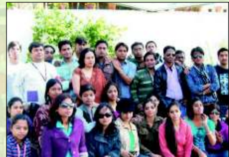
Students with Faculty Members

On 15 th the group returned back with many lessons in the mind.