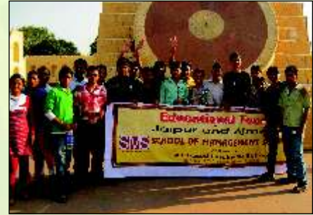
Educational Tour of BCA & BBA

On last day, ambiance was little naughty, students had a DJ Party at hotel premises. Students also got chance to see City Zoo and go for shopping. In this way journey came to an end and students got a refreshing journey with their peer group and faculty members.