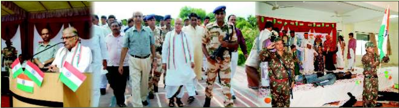
Dr. Murali Manohar Joshi Ex-Union Minister and M.P. at Independence day function