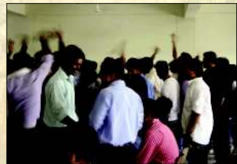
Enjoying the Party

With pulsating ambience, flashing lights & foot tapping music, began the fresher party with a difference. The excitement augmented to a joyful high when the faculty member themselves joined the festivities with students. And as the mercury began to rise, the dance floor was left open for some unbridled exuberance.