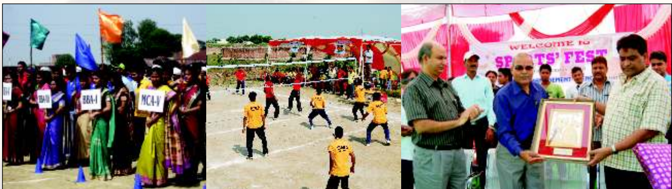
SMS sports fest in Camera