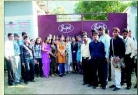
PGDM tour snaps

But a lesson was been thought at each and every step as student were given time limits for different activities which was meant to be followed.