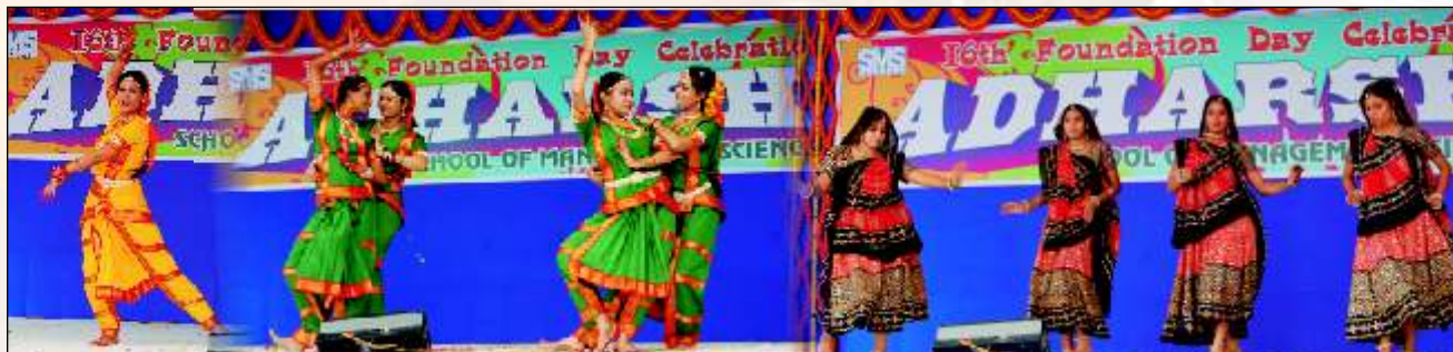
Dancing moments at "Adharshila"