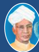
DR. SARVEPALLI RADHAKRISHNAN SCHOLARSHIP

Attractive scholarship scheme is offered to our new students in various PGDM programs.