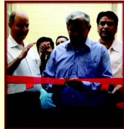
Vice Chancellor - MGKVP

The fifteenth batch of 'Bachelor of Business Administration' (BBA) and fourteenth batch of Bachelor of Computer Applications (BCA) programmes were flagged-off here at School of Management Sciences (SMS) amidst rocketing aspirations to be a part of the corporate enigma with a strong backing of academic feeders of high quality supported by the most modern techno-savvy infrastructure at the Khushipur.