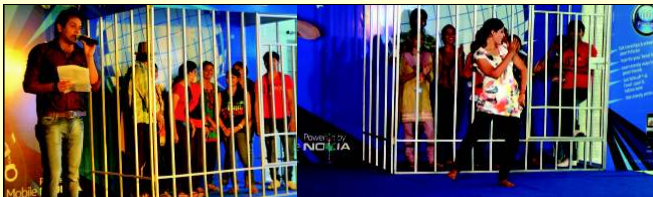
Icons waiting their turn members were also present.