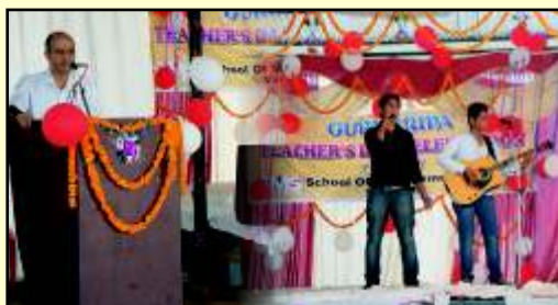
Rock Star in the making

V-tak Integrated Marketing & Event Management Pvt Ltd in association with RED FM 93.5 on behalf of Nokia conducted a College Icon program within the campus of School of Management Sciences, a prestigious institution in the field of management education. The