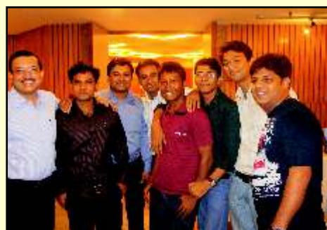
Old Days Remembered

Fun, Frolic, Smiles and rejuvenated Spirit marked the start of the academic session of MCA Batch 2011-