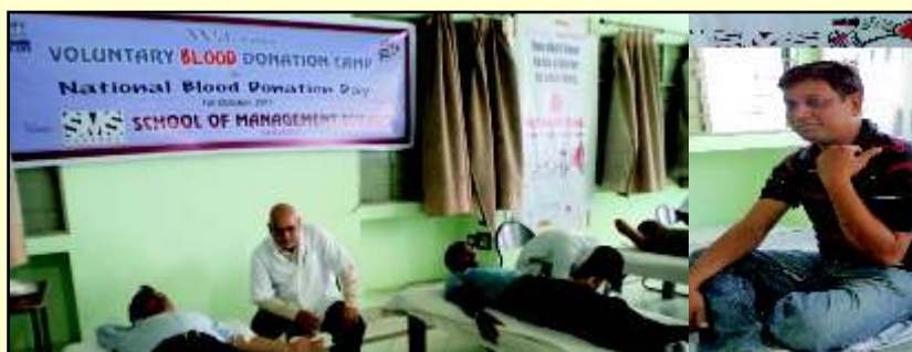
Giving Life to Others

7th Alumni Meet was conducted at SMS campus where the students from the previous batches met and remembered the good old days of the college. The Alumni Meet commenced with the interaction among the alumni students, sharing