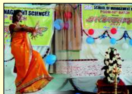
Saraswati Vandana performance