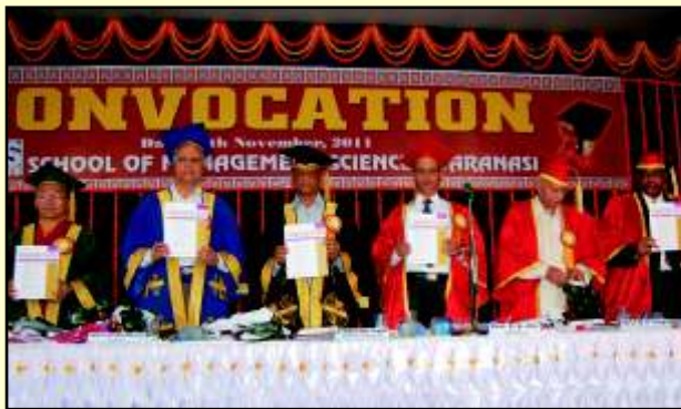
Dignitaries on the Dias during Convocation