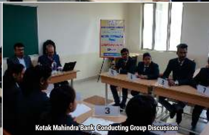
Kotak Mahindra Bank Conducting Group Discussion