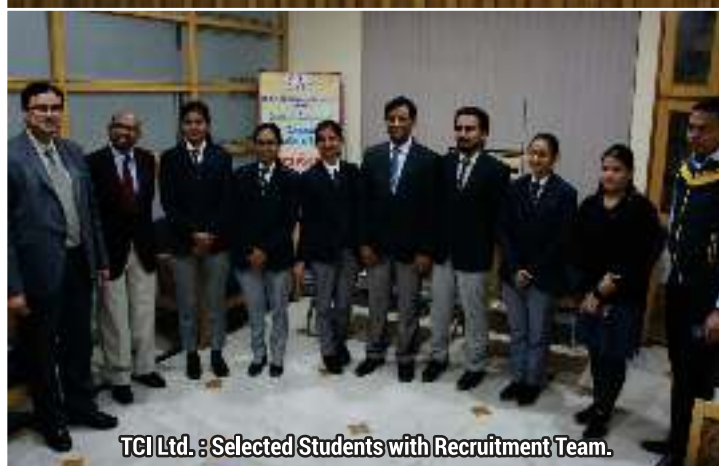
TCI Ltd. : Selected Students with Recruitment Team.