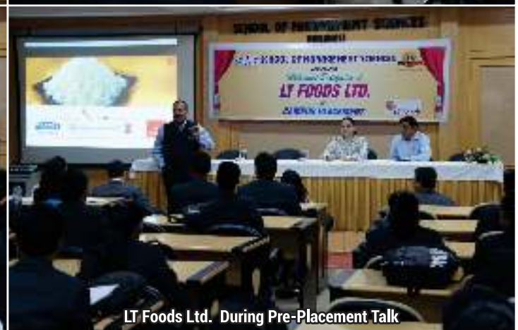
LT Foods Ltd. During Pre-Placement Talk