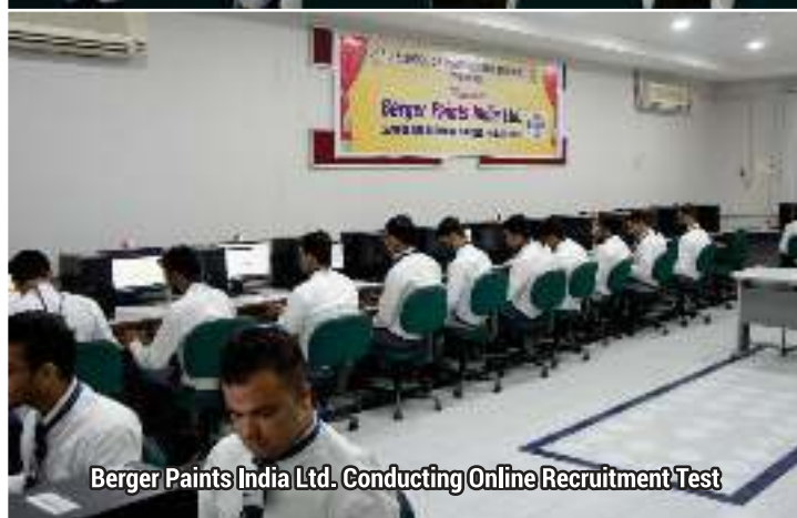
Berger Paints India Ltd. Conducting Online Recruitment Test