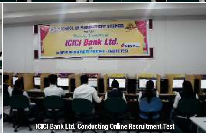
ICICI Bank Ltd. Conducting Online Recruitment Test