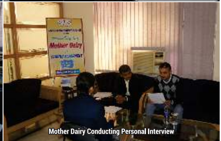
Mother Dairy Conducting Personal Interview