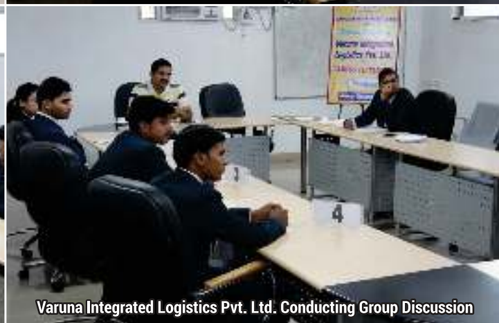
Varuna Integrated Logistics Pvt. Ltd. Conducting Group Discussion