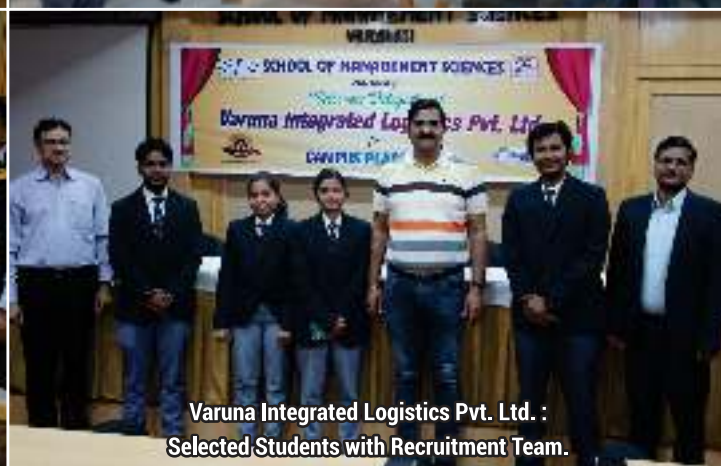
Varuna Integrated Logistics Pvt. Ltd. : Selected Students with Recruitment Team.