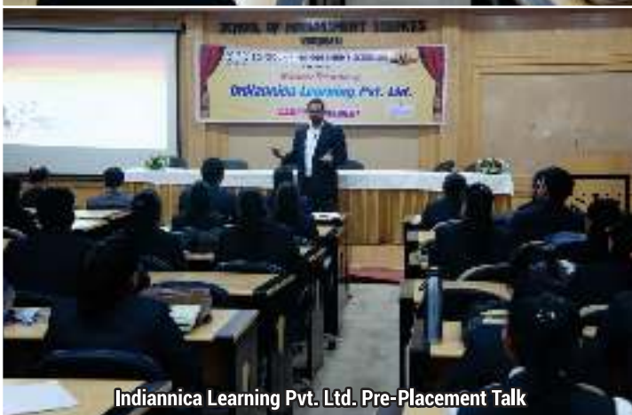
Indiannica Learning Pvt. Ltd. Pre-Placement Talk