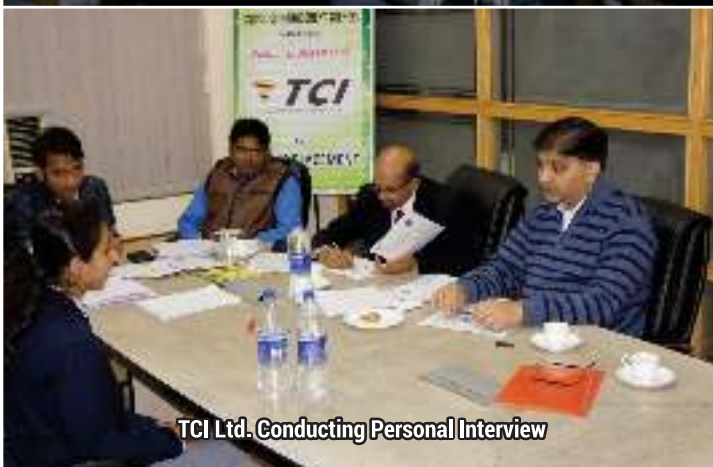
TCI Ltd. Conducting Personal Interview