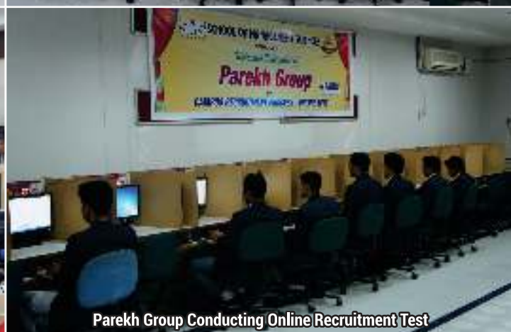
Parekh Group Conducting Online Recruitment Test