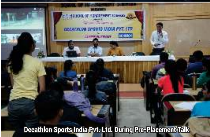
Decathlon Sports India Pvt. Ltd. During Pre-Placement Talk