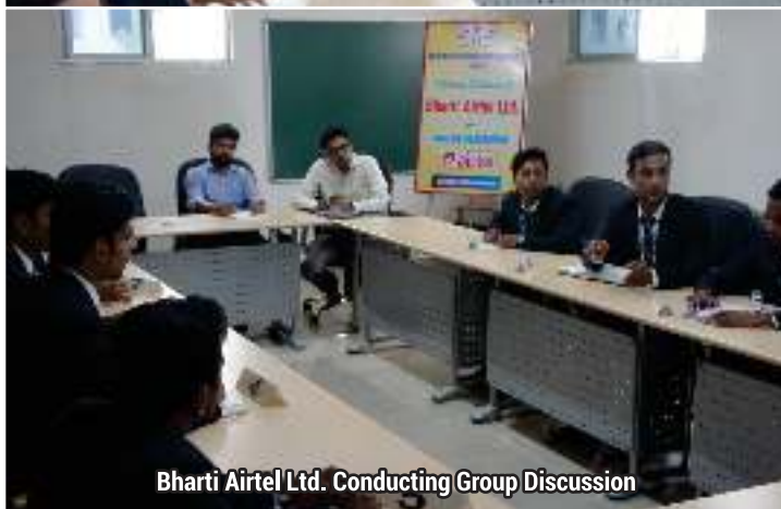
Bharti Airtel Ltd. Conducting Group Discussion