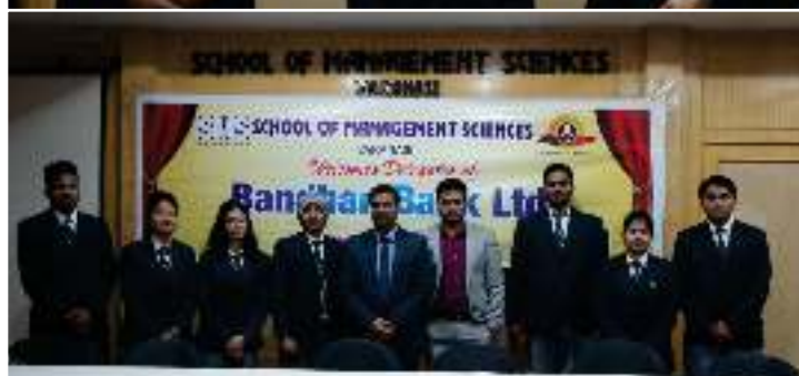
Bandhan Bank Ltd. : Selected Students with Recruitment Team.