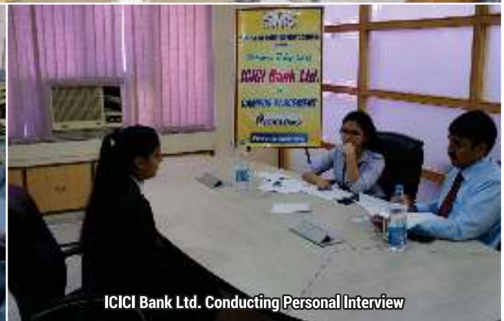
ICICI Bank Ltd. Conducting Personal Interview