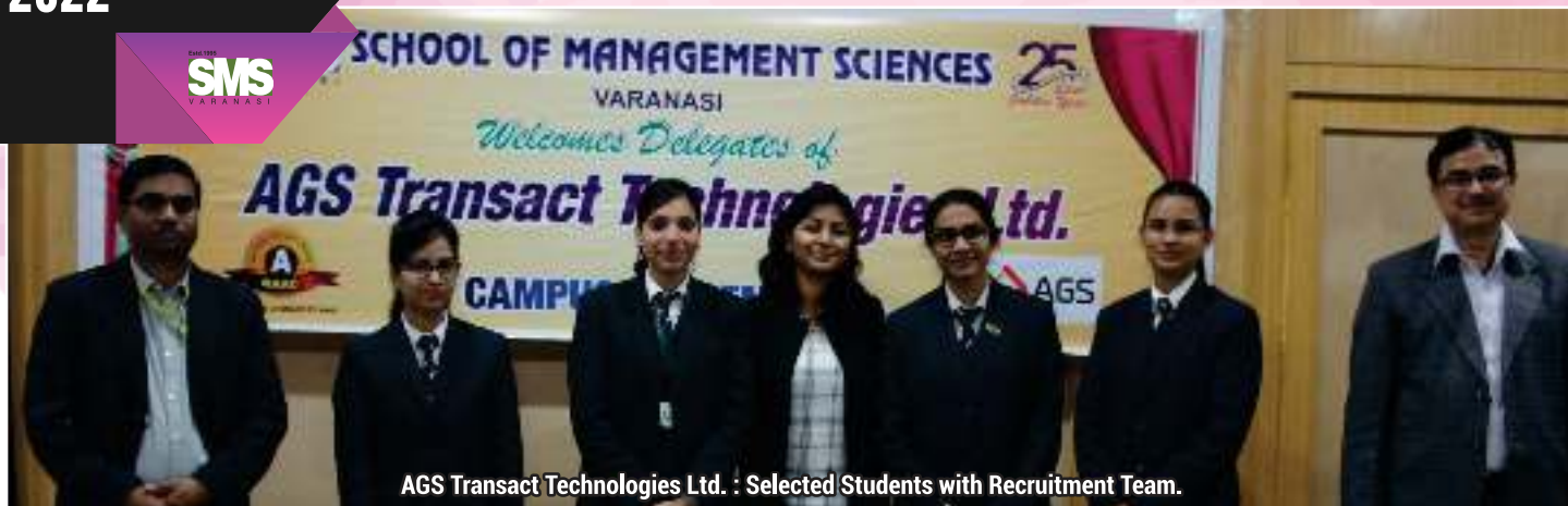
AGS Transact Technologies Ltd. : Selected Students with Recruitment Team.