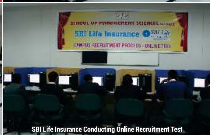
SBI Life Insurance Conducting Online Recruitment Test