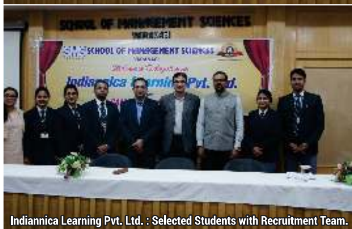
Indiannica Learning Pvt. Ltd. : Selected Students with Recruitment Team.