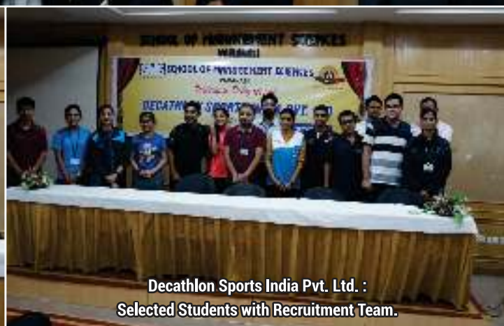
Decathlon Sports India Pvt. Ltd. : Selected Students with Recruitment Team.