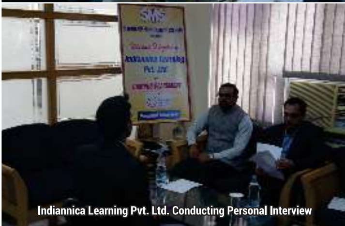
Indiannica Learning Pvt. Ltd. Conducting Personal Interview