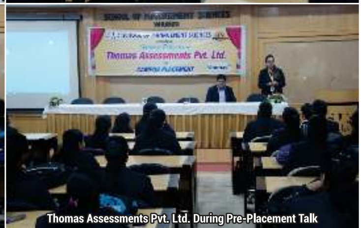
Thomas Assessments Pvt. Ltd. During Pre-Placement Talk