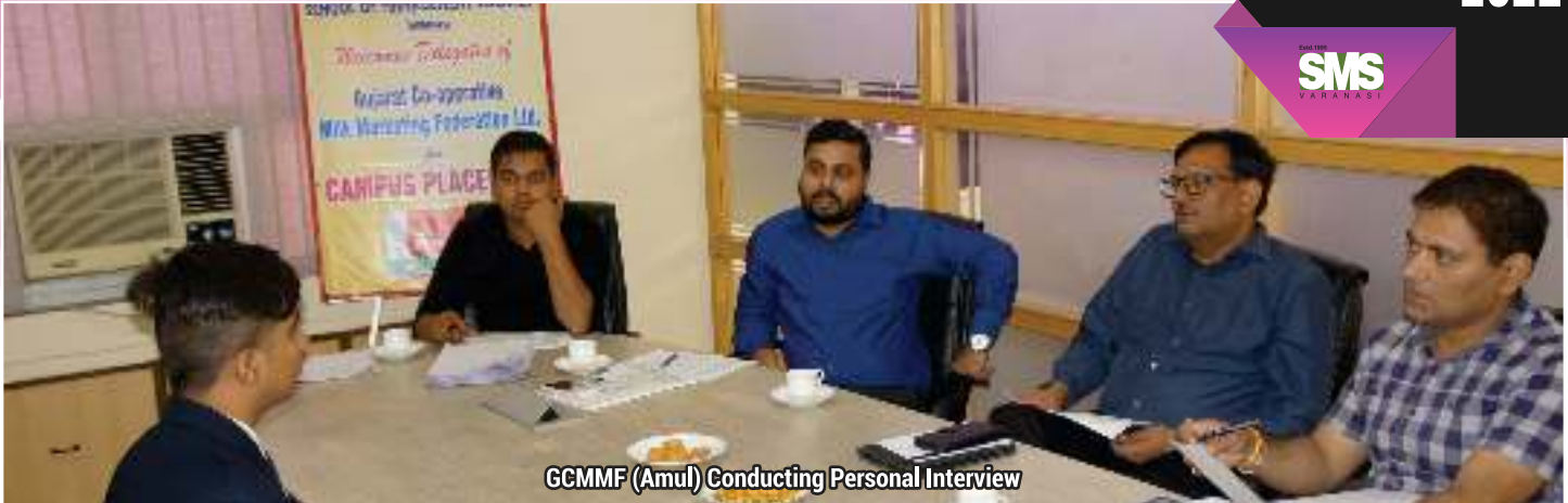
GCMF (Amul) Conducting Personal Interview