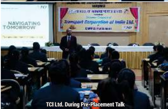
TCI Ltd. During Pre-Placement Talk