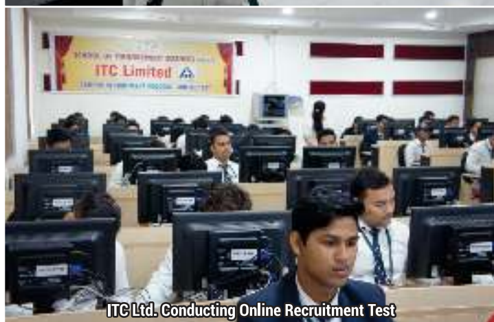
ITC Ltd. Conducting Online Recruitment Test