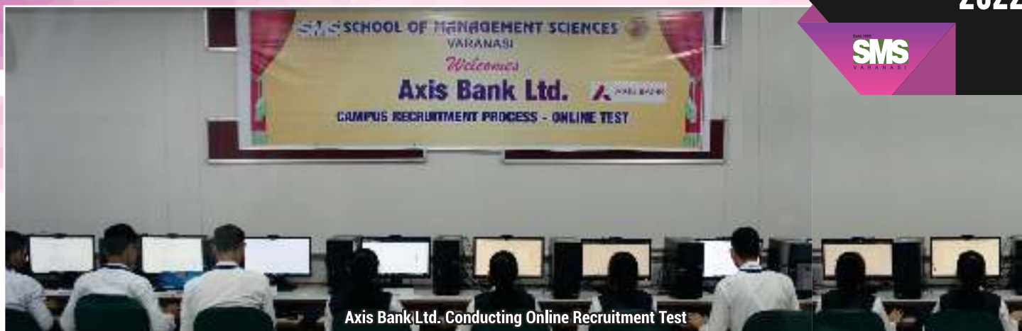
Axis Bank Ltd. Conducting Online Recruitment Test