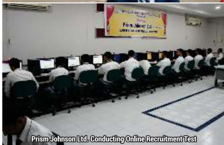
Prism Johnson Ltd. Conducting Online Recruitment Test