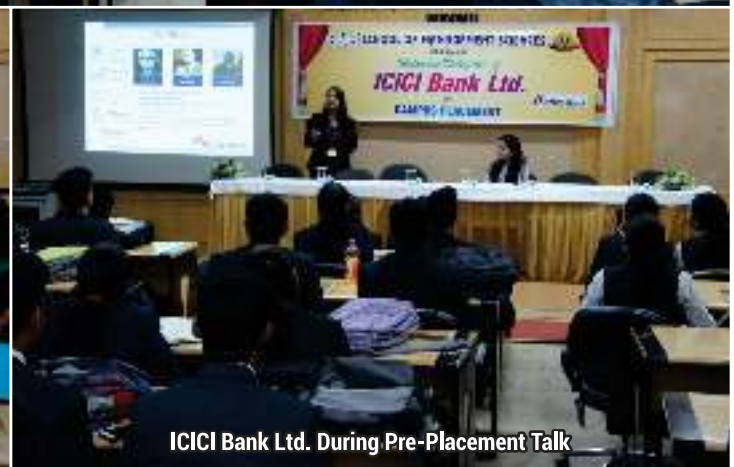
ICICI Bank Ltd. During Pre-Placement Talk