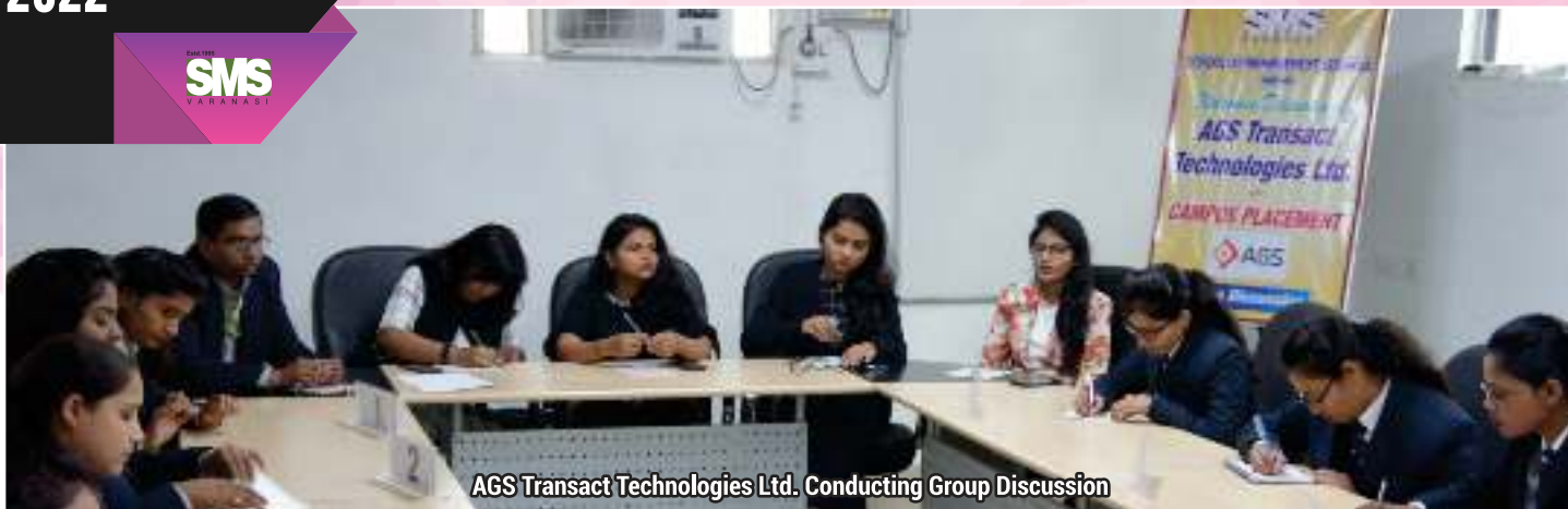
AGS Transact Technologies Ltd. Conducting Group Discussion