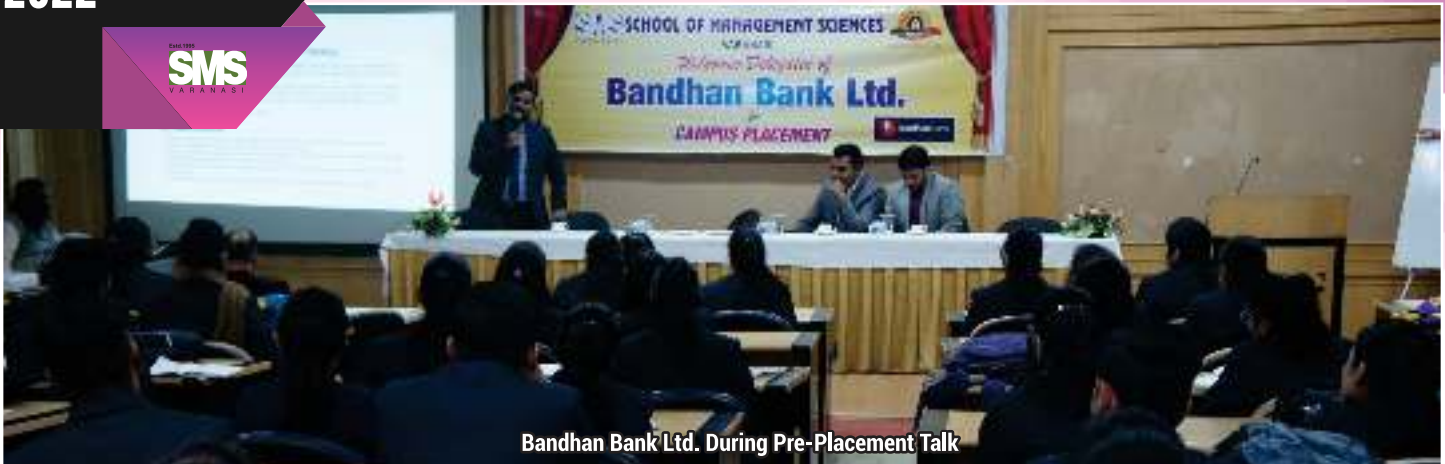
Bandhan Bank Ltd. During Pre-Placement Talk