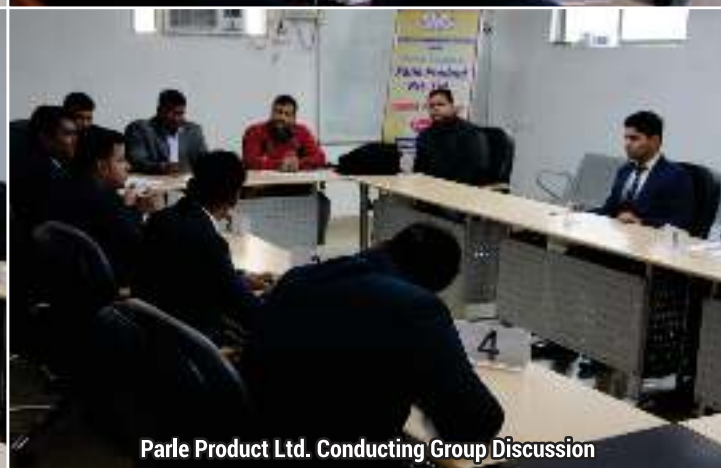
Parle Product Ltd. Conducting Group Discussion