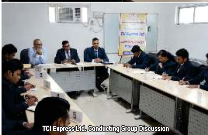
TCI Express Ltd. Conducting Group Discussion