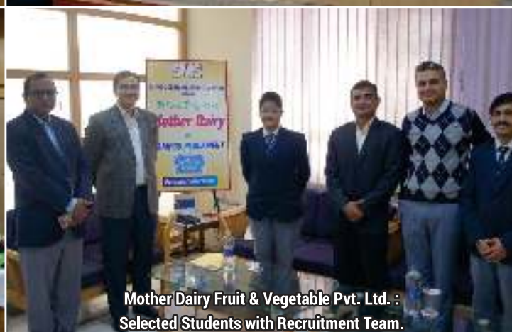
Mother Dairy Fruit & Vegetable Pvt. Ltd. : Selected Students with Recruitment Team.