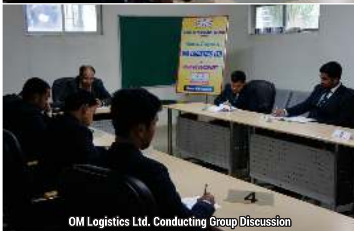
OM Logistics Ltd. Conducting Group Discussion