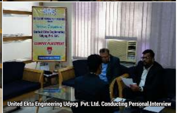
United Ekta Engineering Udyog Pvt. Ltd. Conducting Personal Interview