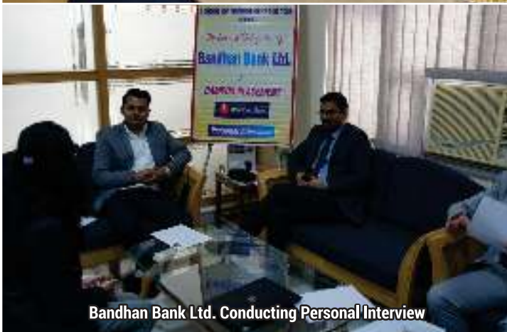
Bandhan Bank Ltd. Conducting Personal Interview